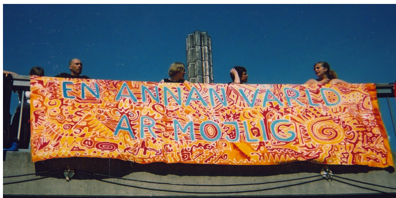
Another world is possible banner at Stockholm Social Forum 2004