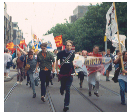
EU Summit protests in Amsterdam 1997