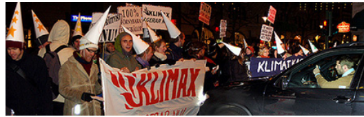
Klimatrock at international Climate Action Day in Malmö 2007. There will be a Climate action at Mölvångstorget Friday at 16.00

The seminar will present the WSF 2009 which will be held in Belem, in the Brazilian Amazonia and the debate on the future