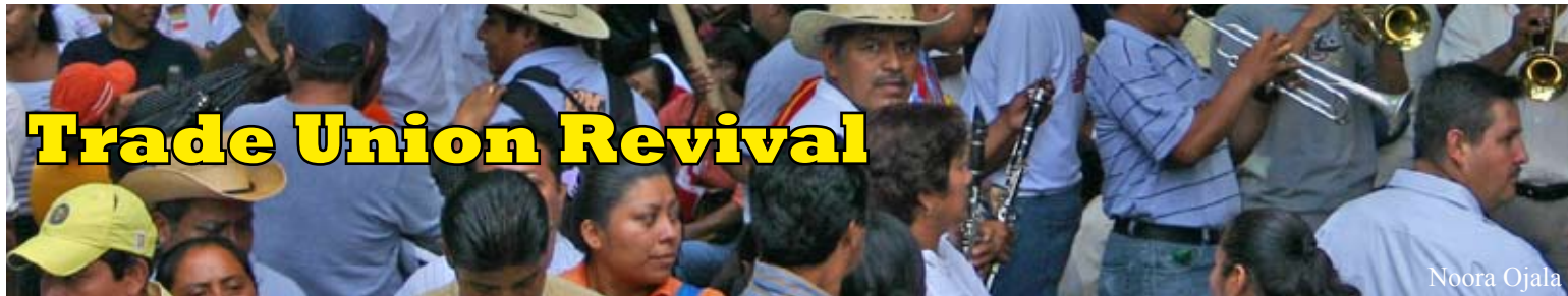
MegaMarcha in June 2008 by Popular Assembly of the Peoples of Oaxaca (APPO)

read more: klimatet.org/2008/02/17/action-report/